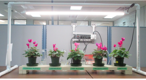
Figure 3: Go & Grow setup for the group participants.