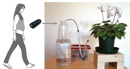
Figure 1: The Go & Grow system linking individuals' activity data to the amount of water that their personal plant receives.

DOI: http://dx.doi.org/10.1145/2909132.2909267